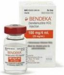
BENDEKA® Treatment of chronic lymphocytic leukemia (CLL) and non-Hodgkin lymphoma (NHL)