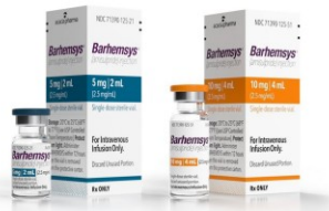
Barhemsys® For prevention of PONV*, and treatment of PONV in patients who received antiemetic prophylaxis with an agent of a different class or have not received prophylaxis